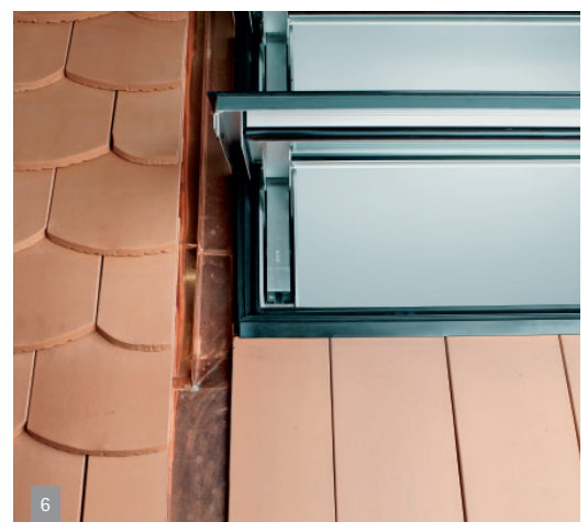
6/9 Bottom interface with open louvers and lateral drip edge.